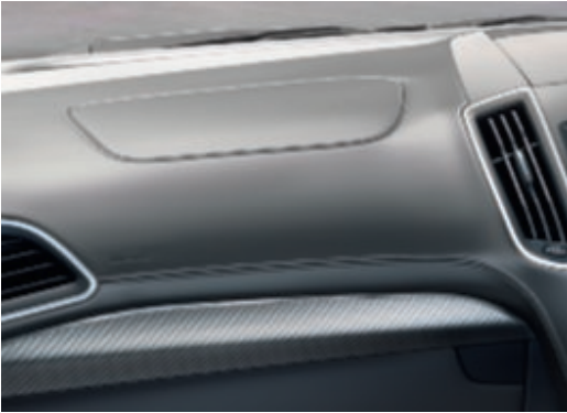
Leather-trimmed instrument panel (Standard)