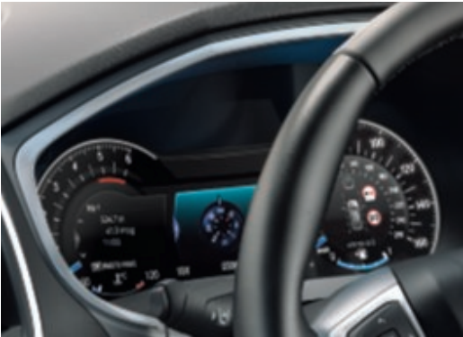
LCD instrument cluster display (Standard)