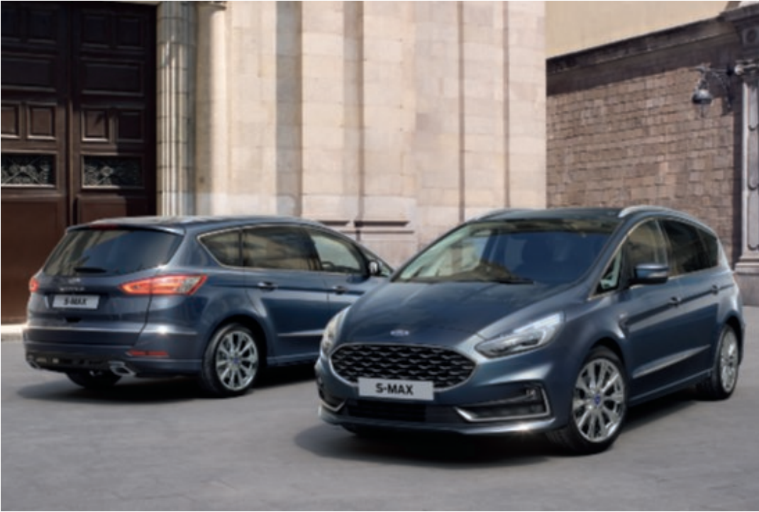
S-MAX Vignale in Blue Panther metallic body colour (option).