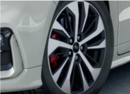
ST-Line 18" alloy wheels with red brake calipers (Standard)