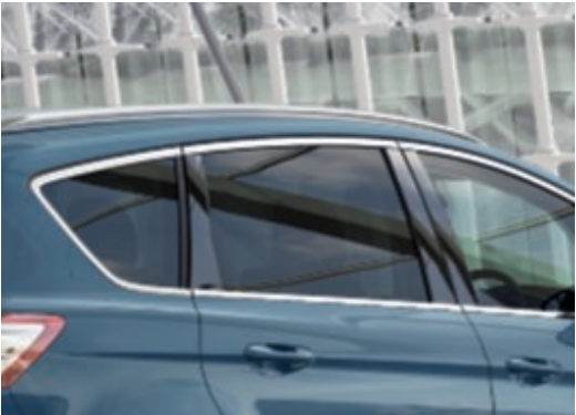
Chrome window surround (Standard)