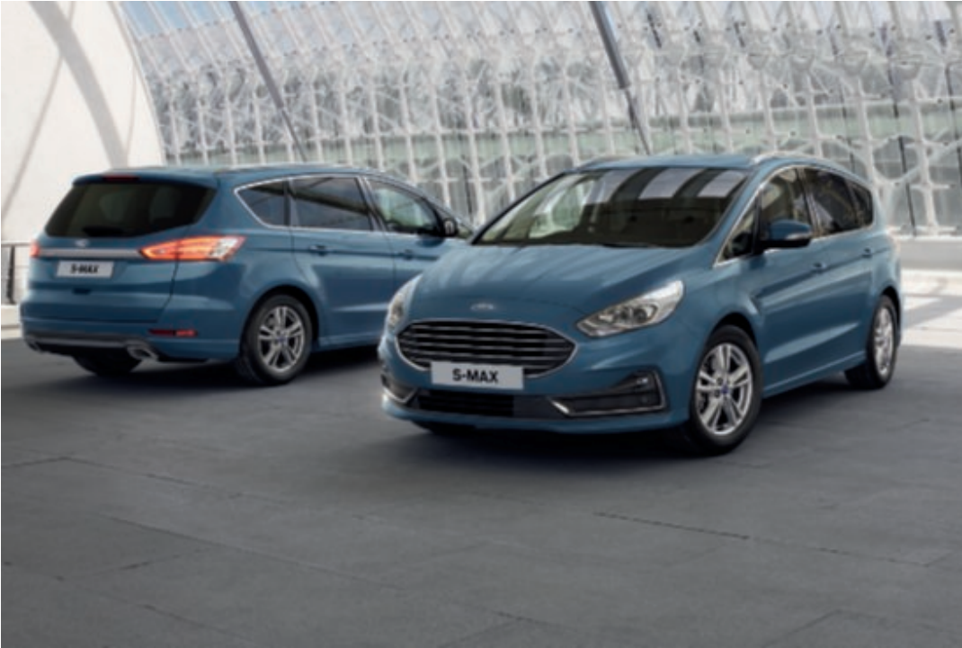
S-MAX Titanium in Chrome Blue metallic body colour (option).