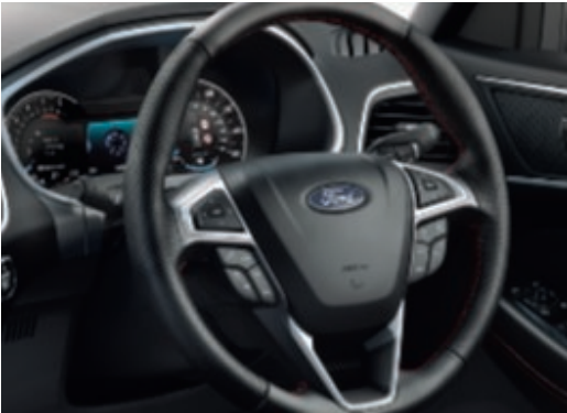
Perforated leather-trimmed steering wheel with red stitching (Standard)