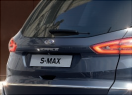
Unique Ford Vignale exterior styling (Standard)