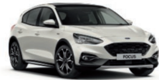
Active X Edition Not available in IRL market