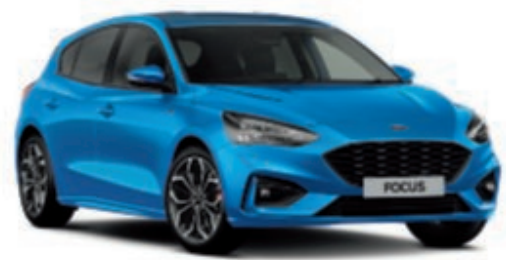
ST-Line X Edition Not available in IRL market