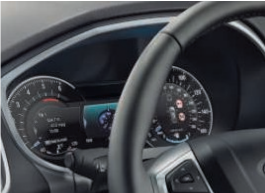
10.1" colour cluster display (Standard)