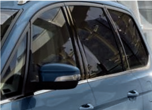
Chrome window surround (Standard)